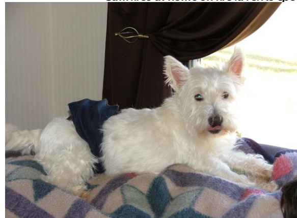
Samwise at home on his favorite spot