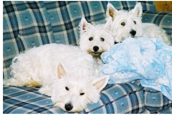
Toby (left), Josie (center) and Tucker (right)

Here is a picture of the kids Tucker and Josie (aka Susie) and Toby. Tucker is doing great! He is still leery of men, but not afraid to up and smell them and get petted!! Josie is making progress, but still has her "safe place" on the corner of the couch, and as you can see, she doesn't care if there is another dog in "her spot" or not.