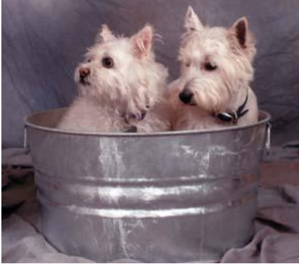
Molly and Sparkle

Because Molly is a mix, she's not quite the clown that Sparkle is. We realized early on that having a real Westie is something like having a toddler in the house! He needs to be 'supervised' and engaged a bit more, making him an endearing 'interactive' little guy. Not a day goes by that we don't enjoy a belly laugh over something Sparkle does – or gets into. Now and then, with Molly looking on in disdain, he even does something he's been forbidden to do, stealing a ball of yarn from Mom's knitting basket, for instance. It's impossible not to laugh when he's caught, yarn-in-mouth, oh-so-sorry (again)!