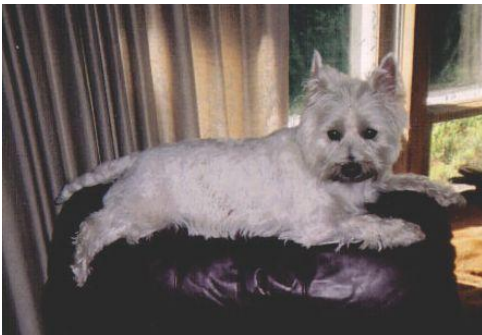
Elvis and his favorite spot!

Greetings fellow Westie Lovers! I am so enjoying life with Elvis! It has been a little over a year since his adoption on December 26 th , 2006. We can't imagine being without him. He is the family favorite and everyone he meets he loves! He enjoys all of the attention he gets! He loves to play ball with anyone he can persuade to keep throwing the ball to him! He has made our life so happy!