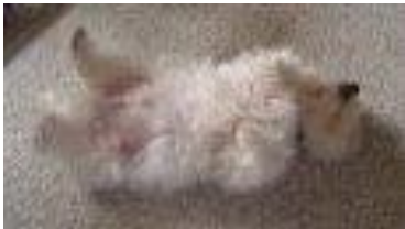
Moment of Westie Zen

I just love summer even through the idea of enjoying the whole summer just lazing about went out several decades ago for me. However, just taking a half-hour here and there to just sit and 'be' is necessary to restore some balance to our hectic lives.