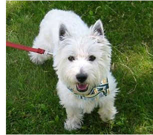
Doc at Westie Fest!!

one with a fenced in yard and NO cats. Doc is fostered in Madison WI.