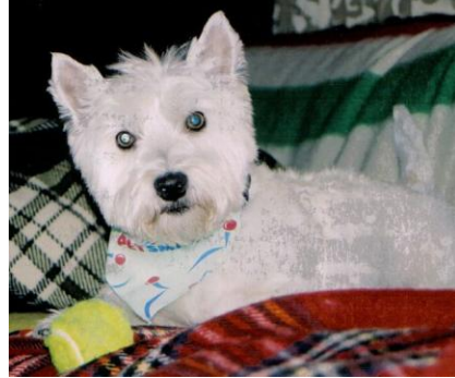
Beethoven is a perfect Love Match!!

doggie park. He also makes little grunting sounds when he wants something. He only barks