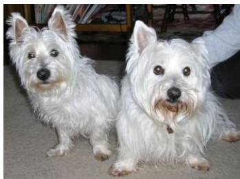
Stuart (left) & Minnie (right)

got us thinking, but we already had a 14 year old Westie named Minnie and we weren't sure about owning two dogs. Stuart won us over!!! After a couple of weeks of fostering him we put in a request to adopt and we were okayed.