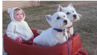
Brisbane, Brodie and Sienna

Brisbane is smart, high energy and is a very good watch dog who will alert us of any animals or people in the vicinity of our property. A few months ago, our older dog, Sidney, passed away and Brisbane has enjoyed becoming the alpha dog in our house. Brisbane loves chewing on rawhides, destroying stuffed animals, taking walks with the family and wrestling with his Westie brother Brodie.