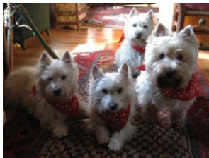
Left to right; Harry, Tucker, Dexter and Sunny

I especially like winter because mom and dad take us snow shoeing with them, and we also go sledding and try to catch them on the sleds. We especially like to roll in the snow and deer poo. We boys are good buddies. Sunny is the oldest at 13 and ½ years old. Dexter will be 4 years old in March, and we are not sure how old Harry is, but he might be 3 years old. We were each rescued and we each have a story to tell about where we came from. We are so happy we were adopted and that we have each other to play with. Dexter and I play chase outside, but Dexter can't catch me because I am smaller and faster than he is. I like to get real close and then veer off at the last moment. It is very funny.