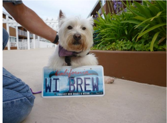
Brewster celebrates his 2 nd anniversary in Aug!

newsletter but did not have previous contact with WWR via adoption or volunteering for us, could you please resend email information to me? Send to 59barbie@charter.net and I will get an e-copy right out to them. In addition, if you sent me an email I did not respond to, it was probably lost too before I got to read it. Please let me know if I missed you!