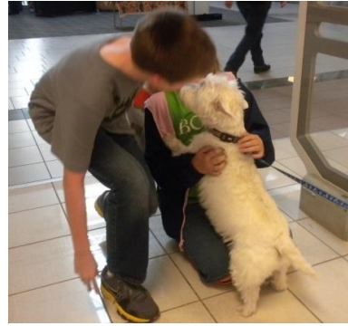
Kisses courtesy of Dexter!

(and buyers) are needed to help sell coupon booklets!